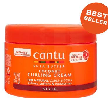
COCONUT CURLING CREAM 340g 07003-12/3NEUS