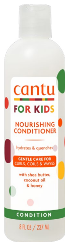
KIDS NOURISHING CONDITIONER 237ml 07547-12/3NEUS