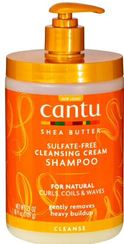
CLEANSING CREAM SHAMPOO SALON SIZE 709g 07906-12/3NEUS