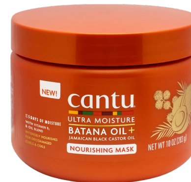
NOURISHING MASK 295G 08524-12/3AEUS