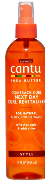
COMEBACK CURL NEXT DAY CURL REVITALIZER 355ml 07565-12/3NEUS