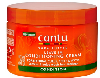
LEAVE-IN CONDITIONING CREAM 340g 07013-12/3NEUS