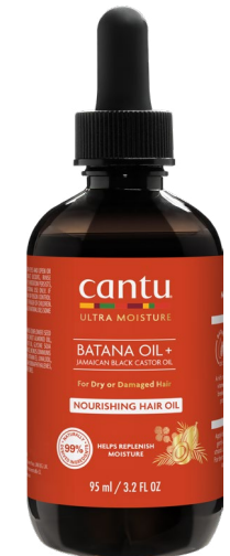
NOURISHING HAIR OIL 95ML 08534-12/3NEU