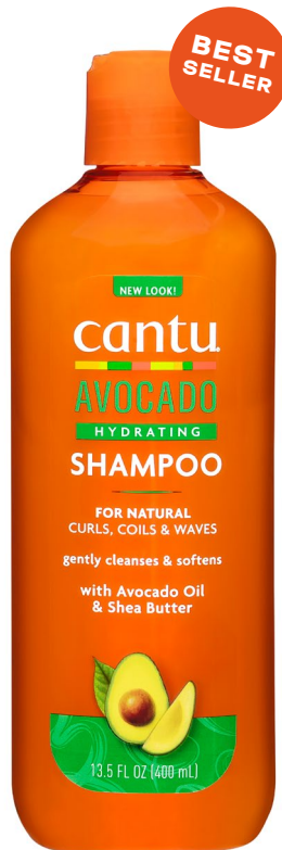
HYDRATING SHAMPOO 400ml 07987-12/3NEUS