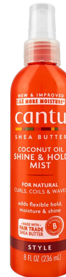
COCONUT OIL SHINE & HOLD MIST 237ml 07006-12/3NEUS