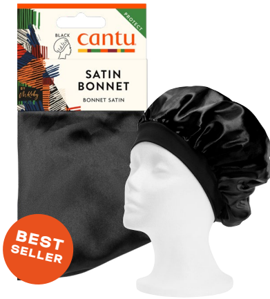
SATIN BONNET 07962-36/3NEU