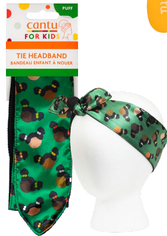
KIDS TIE HEADBAND 08348-36/3NEU