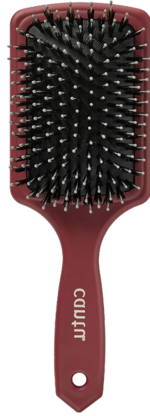
SMOOTH THICK HAIR PADDLE BRUSH 07883-36/3NEU