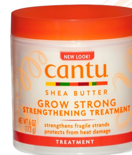
GROW STRONG STRENGTHENING TREATMENT 173g 00004-12/3NEUS