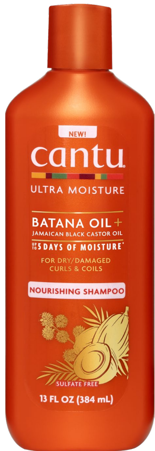
NOURISHING SHAMPOO 355ML 08523-12/3AEUS