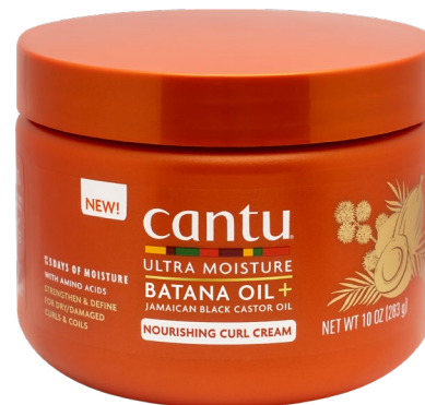
NOURISHING CURL CRM 295G 08526-12/3AEUS