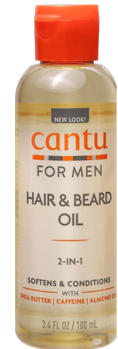
HAIR & BEARD OIL 100ML 07690-12/3NEUS