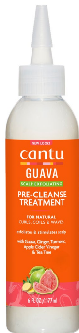
STEP 1 EXFOLIATE EXFOLIATING PRE-CLEANSE TREATMENT 117ml 08241-12/3NEUS