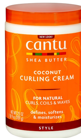
COCONUT CURLING CREAM SALON SIZE 709g 07908-12/3NEUS