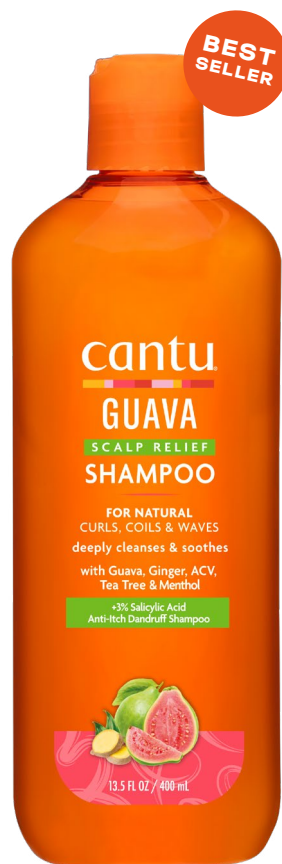
STEP 2 CLEANSE SHAMPOO 400ml 08240-12/3NEUS