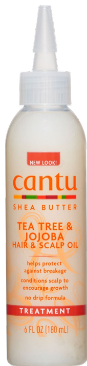
TEA TREE & JOJOBA HAIR & SCALP OIL 180ml 00008-12/3NEUS