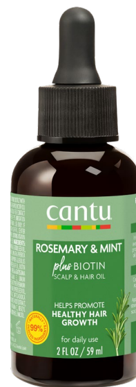
BIOTIN-INFUSED HAIR & SCALP OIL 59ml 08236-12/3NEUSF1

With 99% natural ingredients, it helps promote healthy hair growth.