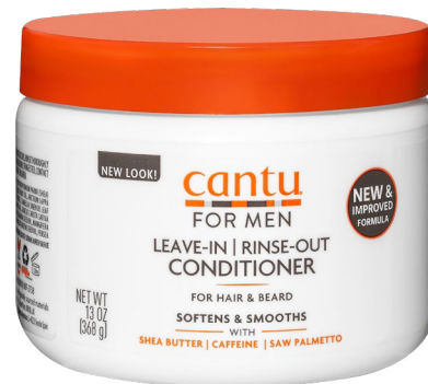
LEAVE-IN CONDITIONER 368G 07677-12/3NEUS