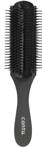
DETANGLE STURDY WASH DAY BRUSH 07955-36/3NEU