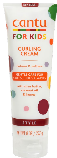
KIDS CURLING CREAM 227g 07543-12/3NEUS