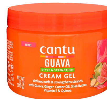
STEP 5 STYLE / DEFINE CREAM GEL 340g 08353-12/3NEUS