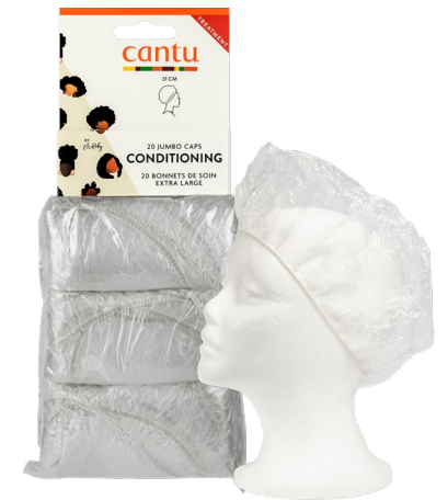
CONDITIONING CAPS 07933-36/3NEU