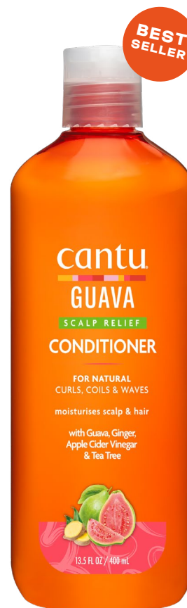
STEP 3 CONDITION CONDITIONER 400ml 08351-12/3NEUS