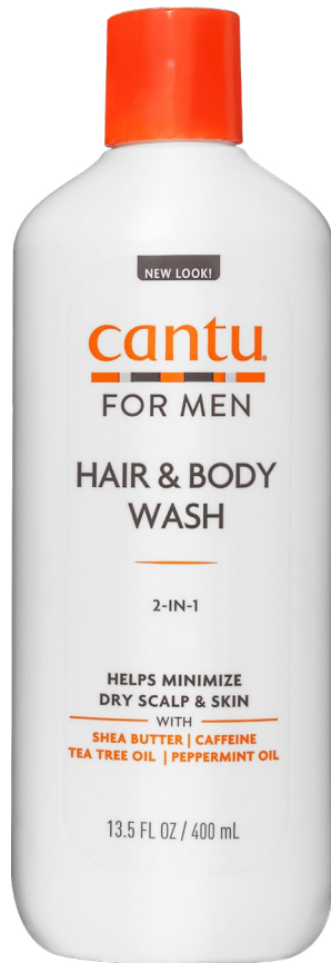
2 IN 1 HAIR & BODY WASH 400ML 07676-12/3NEUS