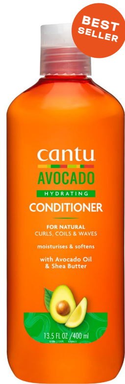
HYDRATING CONDITIONER 400ml 07988-12/3NEUS