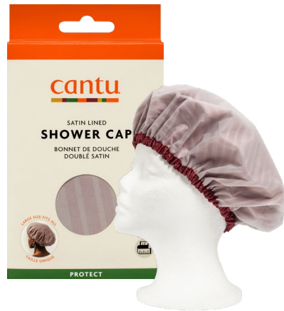
SATIN LINED SHOWER CAP 07960-36/3NEU