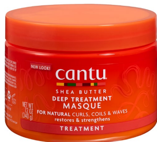
DEEP TREATMENT HAIR MASQUE 340g 07004-12/3NEUS