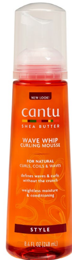
WAVE WHIP CURLING MOUSSE 248ml 07570-12/3NEUS