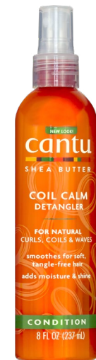
COIL CALM DETANGLER 237ml 07534-12/3NEUS