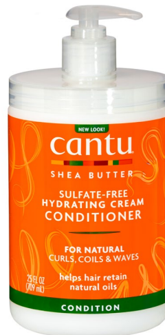
HYDRATING CREAM CONDITIONER SALON SIZE 709ml 07907-12/3NEUS