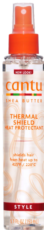
THERMAL SHIELD HEAT PROTECTANT 151ml 07558-12/3NEUS