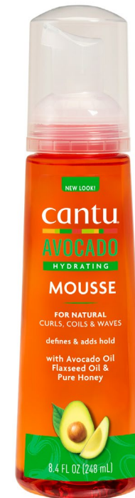
HYDRATING MOUSSE 248ml 08239-12/3NEUS