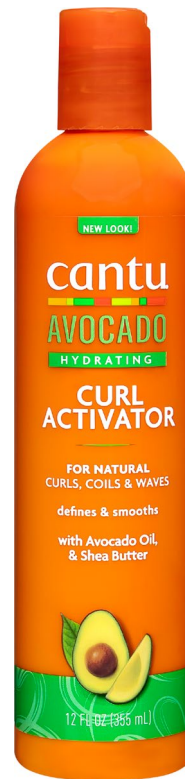
HYDRATING CURL ACTIVATOR 355ml 07991-12/3NEUS