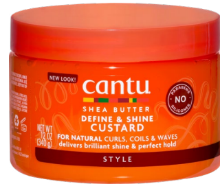
DEFINE & SHINE CUSTARD 340g 07012-12/3NEUS