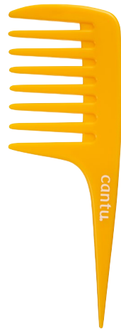
ULTRA GLIDE DETANGLING COMB 08281-36/3NEUS