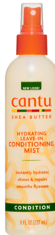
LEAVE-IN CONDITIONING MIST 237ml 07620-12/3NEUS