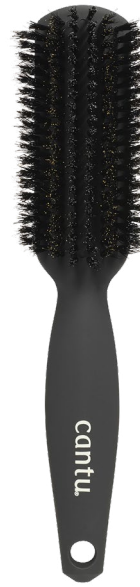
SMOOTH THICK HAIR STYLER 07888-36/3NEU