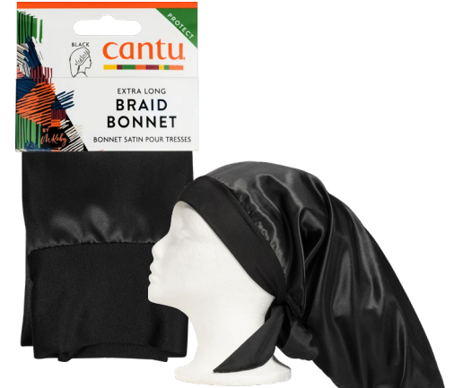
EXTRA LONG BRAID BONNET 07951-36/3NEU