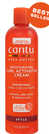
MOISTURIZING CURL ACTIVATOR CREAM 355ml 07000-12/3NEUS