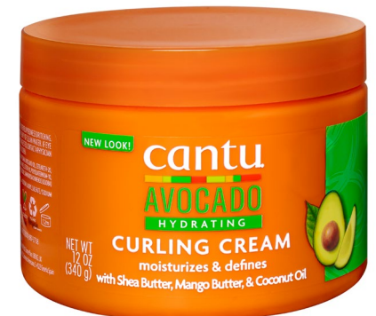
HYDRATING CURLING CREAM 340g 07990-12/3NEUS