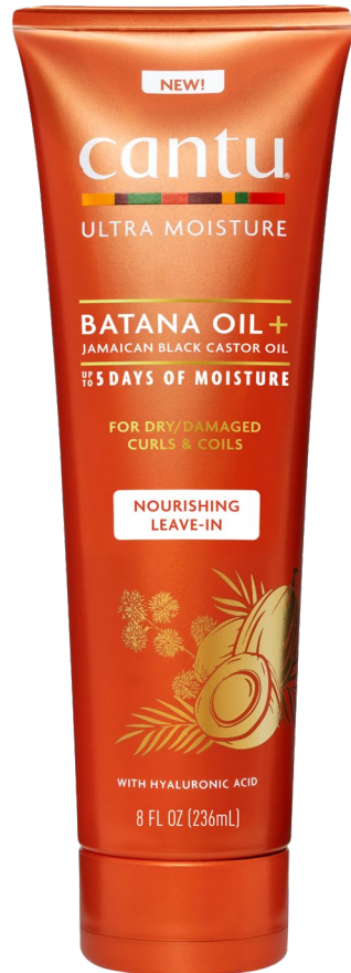
NOURISHING LEAVE-IN 236ML 08525-12/3AEUS