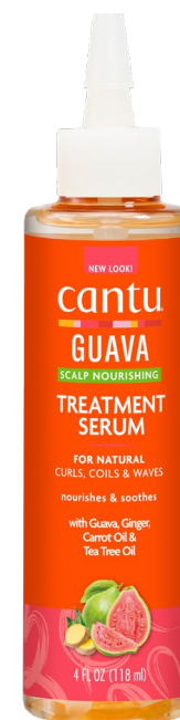
STEP 4 NOURISH TREATMENT SERUM 118ml 08244-12/3NEUS