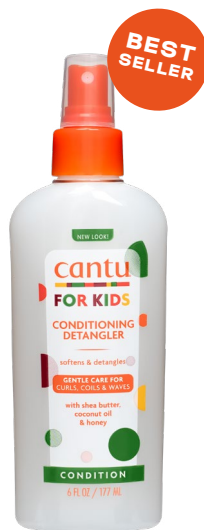
KIDS CONDITIONING DETANGLER 177ml 07544-12/3NEUS