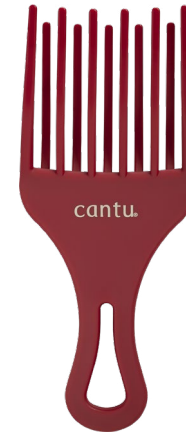
STURDY DOUBLE LIFT PICK 07892-36/3NEU