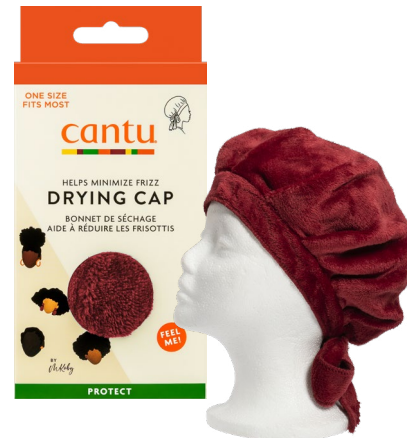
MICROFIBER DRYING CAP 08075-36/3NEU