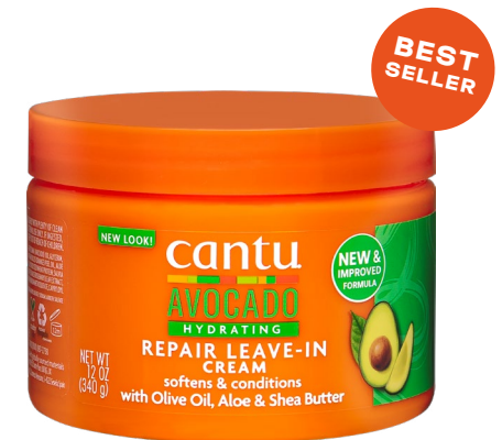
HYDRATING LEAVE-IN REPAIR CREAM 340g 07989-12/3NEUS