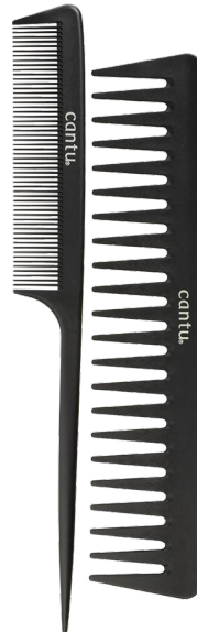
STYLE CARBON FIBRE COMBS 07894-36/3NEU