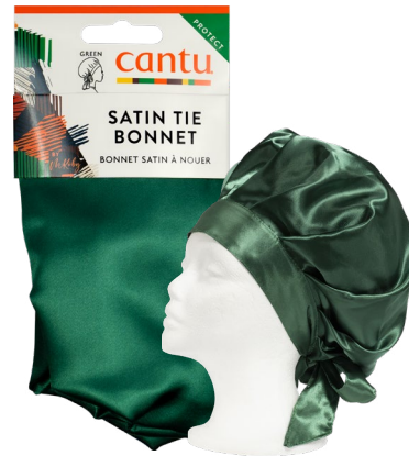
SATIN TIE BONNET 08073-36/3NEU