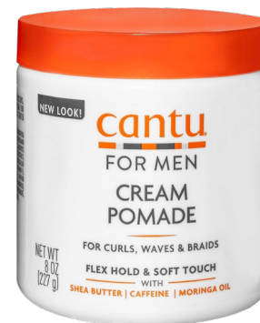
STYLING CREAM POMADE 227G 07678-12/3NEUS