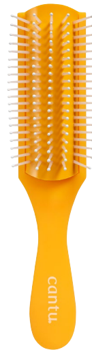
ULTRA GLIDE DETANGLING BRUSH 08279-36/3NEUS