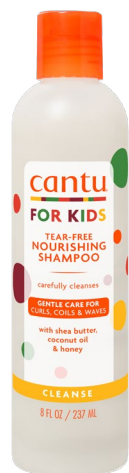
KIDS TEARS-FREE NOURISHING SHAMPOO 237ml 07546-12/3NEUS