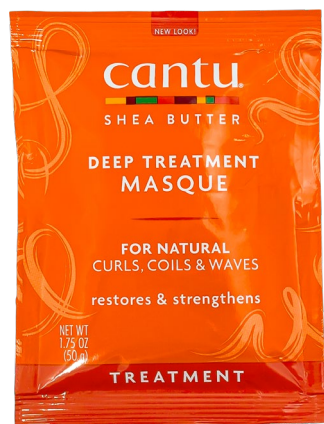
DEEP TREATMENT HAIR MASQUE 55g 07632-24/6NEUS