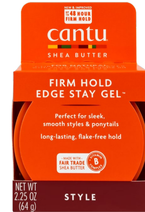
EXTRA HOLD EDGE STAY GEL 64g 07569-12/4NEUS