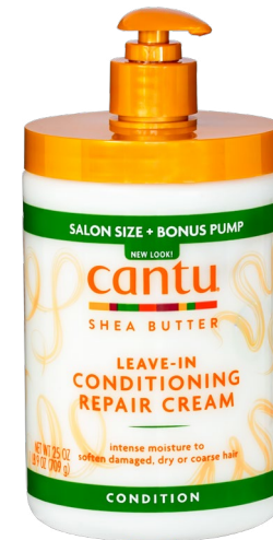
LEAVE-IN CONDITIONING REPAIR CREAM SALON SIZE 709g 00068-6NEUS