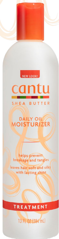
DAILY OIL MOISTURIZER 384ml 00006-12/3NEUS

Powerful, conditioning formulations to moisturise, repair, soften & define natural or chemically treated hair.