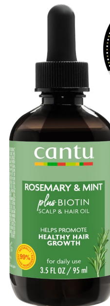
BIOTIN-INFUSED HAIR & SCALP OIL 95ml 08385-12/3NEUS1