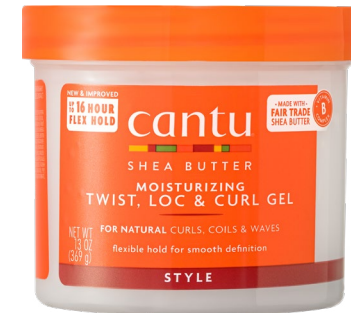
TWIST, LOC AND CURL GEL 370g 07005-12/3NEUS