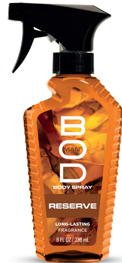
192624003991 Reserve 8 fl oz