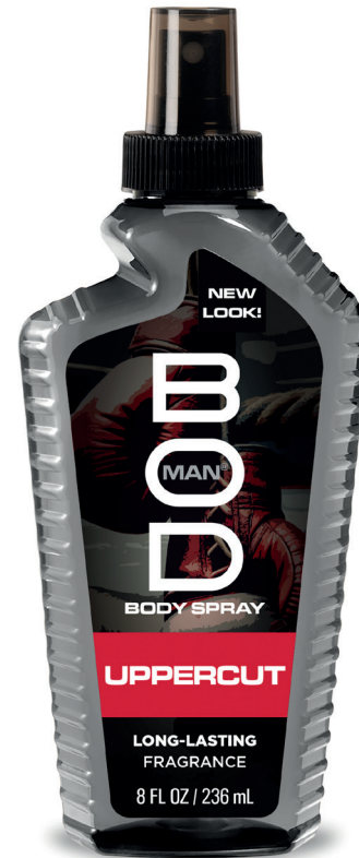
026169045812 Uppercut 8 fl oz

Magnetic and energetic, we invite you to make BOD Man Upper Cut Fragrance Body Spray your signature scent. Our expert perfume crafters designed it so that bergamot, cardamom, and coriander greet you at the door, bringing you a feeling of total freshness. Jasmine, orange blossom, and white flowers add complexity to a unique base of patchouli, tonka bean, amber, and oakmoss. This long-lasting fragrance enters the room with an upper cut.