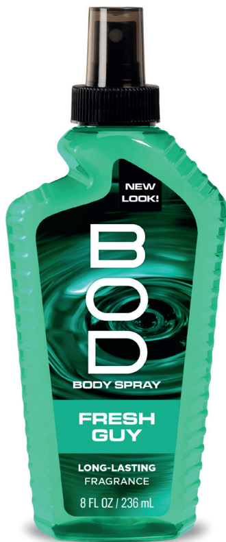
026169059741 Fresh Guy 8 fl oz