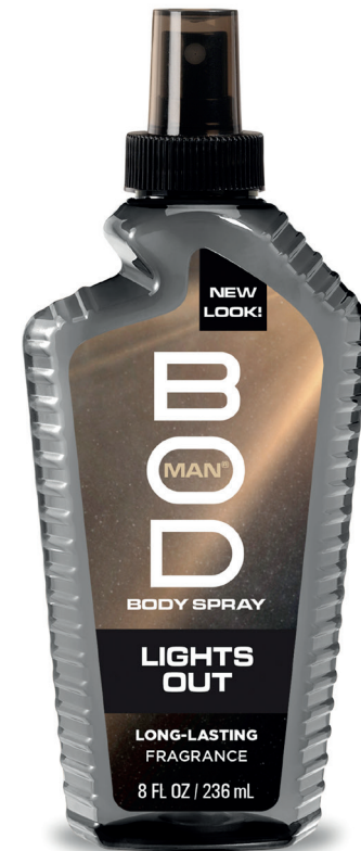
026169055316 Lights Out 8 fl oz

ORIENTAL, SPICY. When the lights go down, the energy turns up. BOD Man Lights Out Fragrance Body Spray is built for the moments that matter most after dark. It opens with a cool rush of mint, juicy grapefruit, and crisp cypress that wakes up the senses. The heart turns up the heat with exotic spices, wild rose, and earthy patchouli for a scent that radiates confidence and edge. Warm amber, rich leather, and smoky wood form a bold, lasting base that follows you long into the night. Step into your most magnetic self when you wear Lights Out.