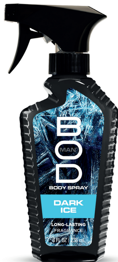
026169050830 Dark Ice 8 fl oz