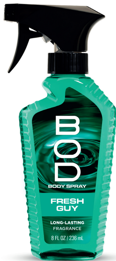
026169059741 Fresh Guy 8 fl oz