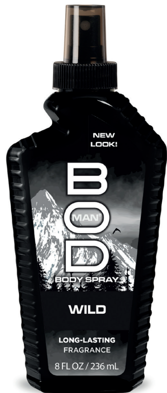
192624001959 Wild 8 fl oz