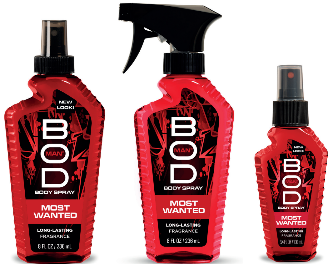
26169051653 Most Wanted 8 fl oz

Pull anyone into your orbit when you wear BOD Man Most Wanted Fragrance Body Spray. An intoxicating blend of bergamot, fresh sage, lemon zest, and more greet whomever you meet at their first inhale. This is followed by calming natural scents such as English lavender and cedarwood. Finally, amber, oakmoss, and musk form the foundation of this enriching fragrance. When crafting this fragrance, we wanted something that truly embodied swagger and confidence. Step into your truest self when you wear it.