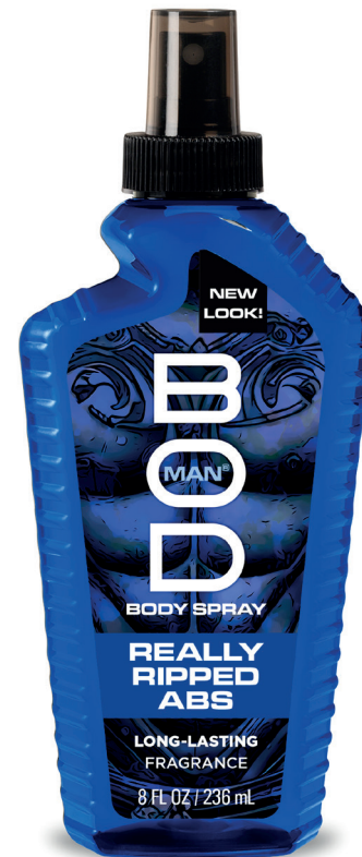
026169059314 Really Ripped Abs 8 fl oz

Experience pure confidence all day long with this combination of powerful musk and woody scents. BOD Man Really Ripped Abs Fragrance Body Spray kicks things off with uplifting top notes of bergamot and mandarin orange. It's followed by a fresh, natural outdoorsy sensation featuring crisp green sage, geranium, and lavender. Warm musk, creamy sandalwood, and cedarwood bring it all together, leaving you ready to take on the day. BOD Man Really Ripped Abs Fragrance Body Spray is more than just a fragrance; it's your key to a confidence boost like no other.