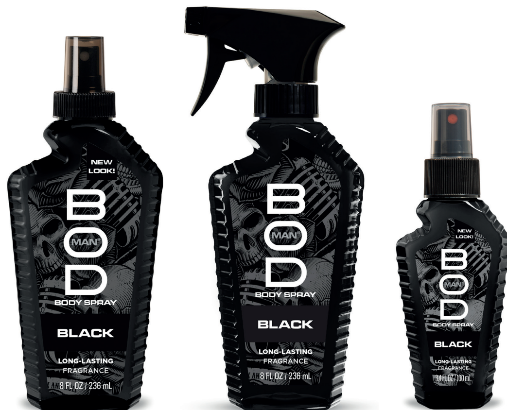
026169059802 Black 8 fl oz