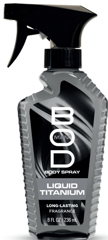
192624001775 Liquid Titanium 8 fl oz