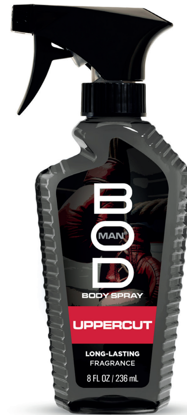
026169045812 Uppercut 8 fl oz