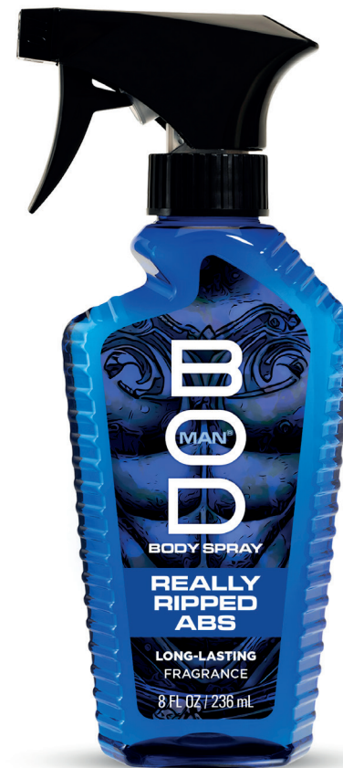
026169059314 Really Ripped Abs 8 fl oz