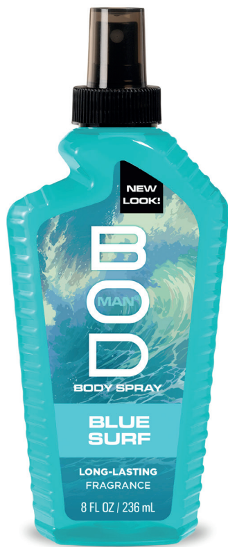
026169055231 Blue Surf 8 fl oz