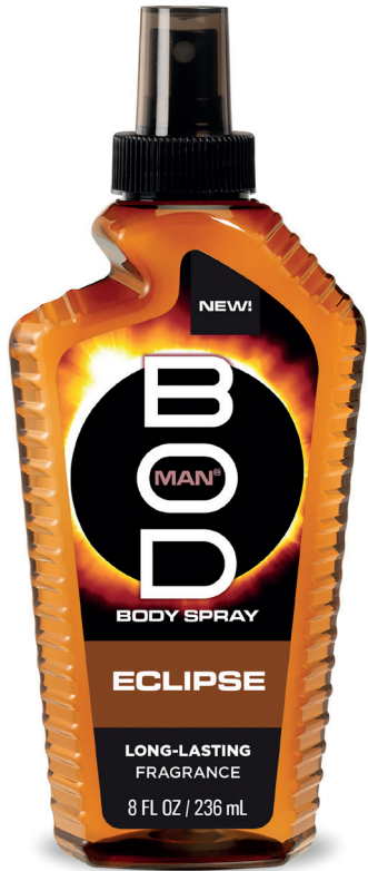
192624009474 Eclipse 8 fl oz