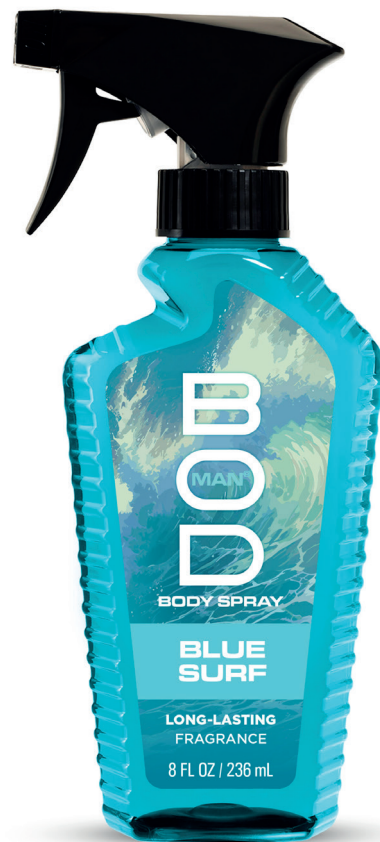
026169055231 Blue Surf 8 fl oz