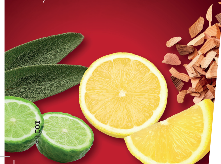
026169051769 Most Wanted 3.4 fl oz