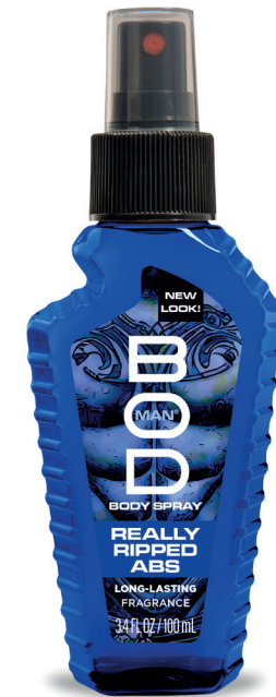
026169057570 Really Ripped Abs 3.4 fl oz