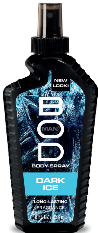
026169050830 Dark Ice 8 fl oz