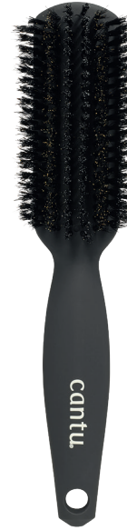
SMOOTH THICK HAIR STYLER 07888-36/3NEU