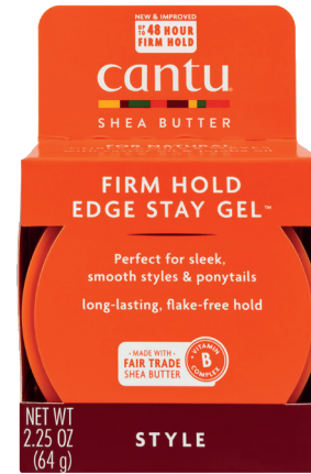
EXTRA HOLD EDGE STAY GEL 64g 07569-12/4NEUS