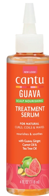
STEP 4 NOURISH TREATMENT SERUM 118ml 08244-12/3NEUS