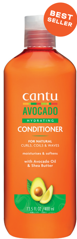
HYDRATING CONDITIONER 400ml 07988-12/3NEUS