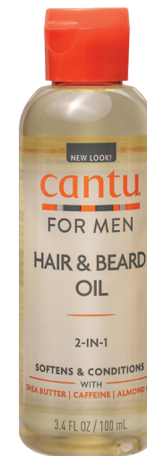
HAIR & BEARD OIL 100ML 07690-12/3NEUS