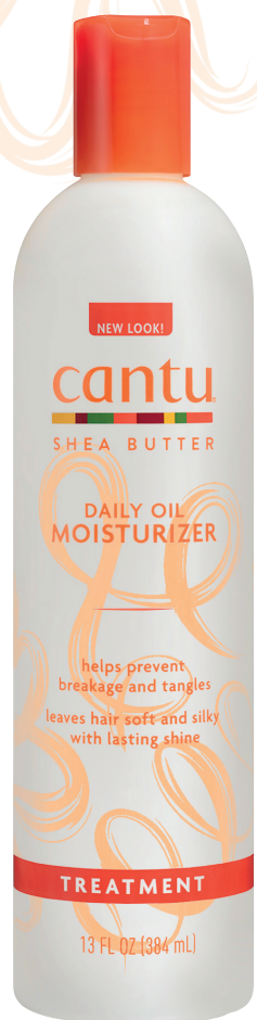
DAILY OIL MOISTURIZER 384ml 00006-12/3NEUS

TYPE 3 CURLS NEEDS MODERATE MOISTURE AND HYDRATION