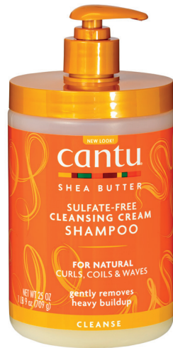
CLEANSING CREAM SHAMPOO SALON SIZE 709g 07906-12/3NEUS