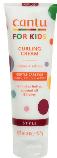
KIDS CURLING CREAM 227g 07543-12/3NEUS