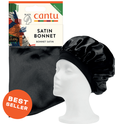
SATIN BONNET 07962-36/3NEU