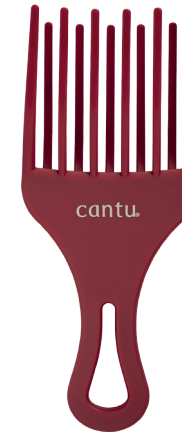
STURDY DOUBLE LIFT PICK 07892-36/3NEU