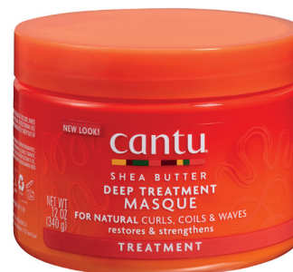
DEEP TREATMENT HAIR MASQUE 340g 07004-12/3NEUS