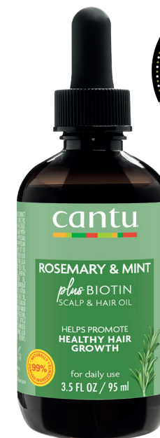
BIOTIN-INFUSED HAIR & SCALP OIL 95ml 08385-12/3NEUS1