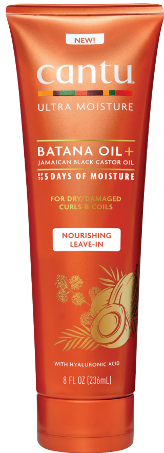
NOURISHING LEAVE-IN 236ML 08525-12/3AEUS