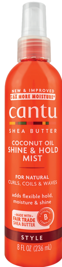
COCONUT OIL SHINE & HOLD MIST 237ml 07006-12/3NEUS