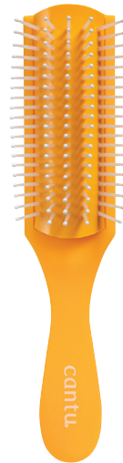
ULTRA GLIDE DETANGLING BRUSH 08279-36/3NEUS