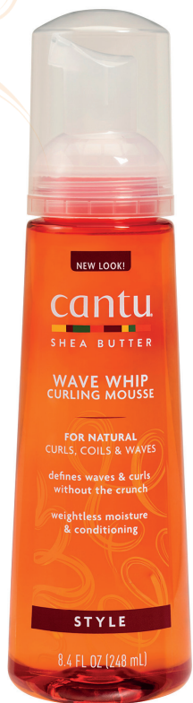
WAVE WHIP CURLING MOUSSE 248ml 07570-12/3NEUS