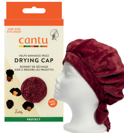
MICROFIBER DRYING CAP 08075-36/3NEU