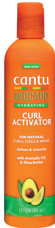
HYDRATING CURL ACTIVATOR 355ml 07991-12/3NEUS