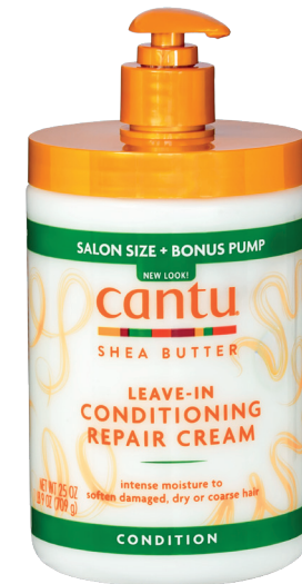
LEAVE-IN CONDITIONING REPAIR CREAM SALON SIZE 709g 00068-6NEUS