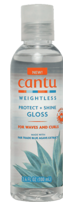
STEP 6 SHINE PROTECT + SHINE GLOSS 100ml 08435-L03EUS