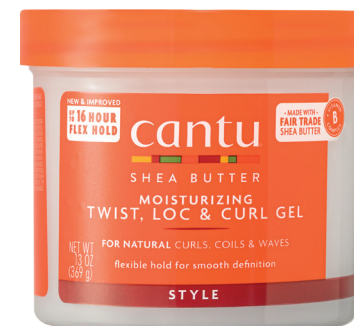
TWIST, LOC AND CURL GEL 370g 07005-12/3NEUS