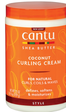
COCONUT CURLING CREAM SALON SIZE 709g 07908-12/3NEUS