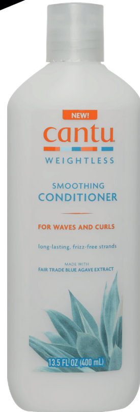
STEP 2 CONDITION SMOOTHING CONDITIONER 400ml 08396-B02EUS