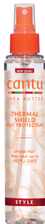
THERMAL SHIELD HEAT PROTECTANT 151ml 07558-12/3NEUS