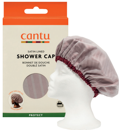
SATIN LINED SHOWER CAP 07960-36/3NEU