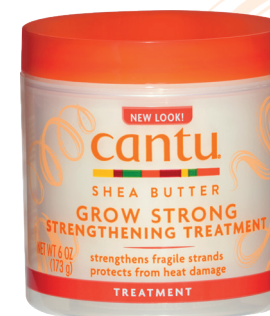
GROW STRONG STRENGTHENING TREATMENT 173g 00004-12/3NEUS