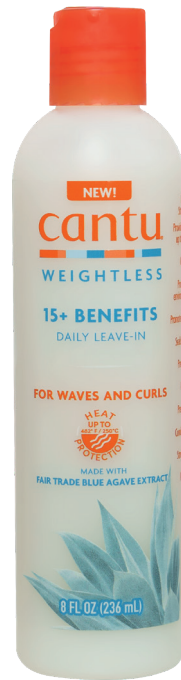
STEP 3 TREATMENT 15+ BENEFITS DAILY LEAVE-IN 236ml 08386-L01EUS