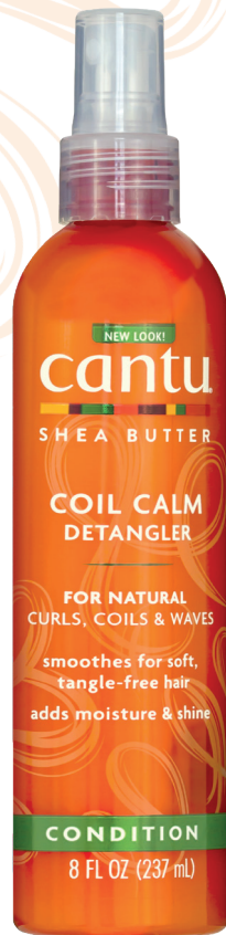
COIL CALM DETANGLER 237ml 07534-12/3NEUS