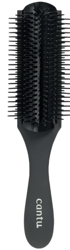
DETANGLE STURDY WASH DAY BRUSH 07955-36/3NEU