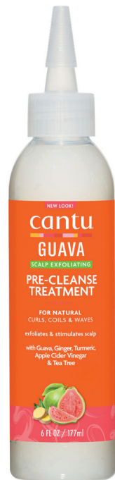
STEP 1 EXFOLIATE EXFOLIATING PRE-CLEANSE TREATMENT 117ml 08241-12/3NEUS