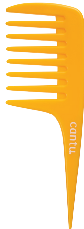
ULTRA GLIDE DETANGLING COMB 08281-36/3NEUS