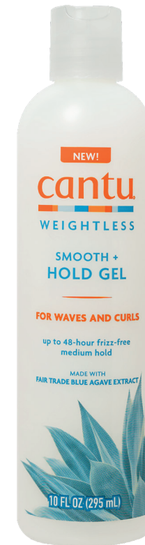
STEP 5 STYLE / DEFINE SMOOTH + HOLD GEL 295ml 08437-L02EUS