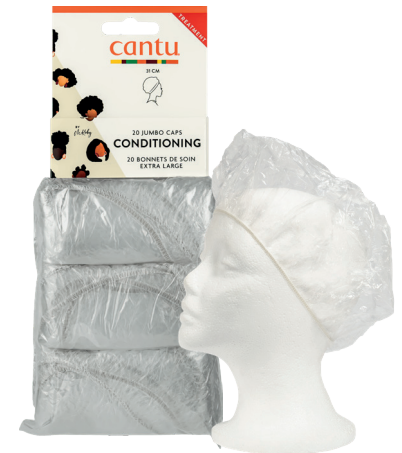
CONDITIONING CAPS 07933-36/3NEU