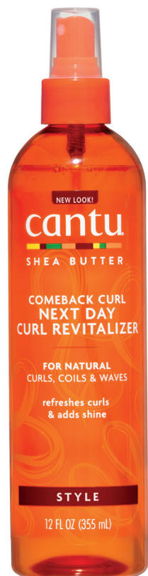
COMEBACK CURL NEXT DAY CURL REVITALIZER 355ml 07565-12/3NEUS