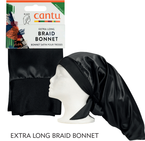
EXTRA LONG BRAID BONNET 07951-36/3NEU