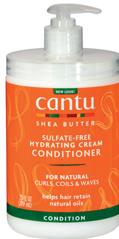
HYDRATING CREAM CONDITIONER SALON SIZE 709ml 07907-12/3NEUS