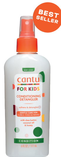
KIDS CONDITIONING DETANGLER 177ml 07544-12/3NEUS