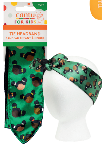
KIDS TIE HEADBAND 08348-36/3NEU