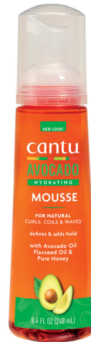
HYDRATING MOUSSE 248ml 08239-12/3NEUS