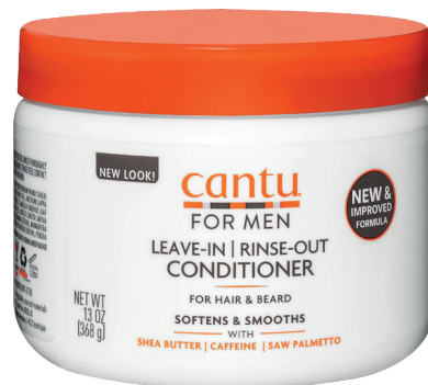
LEAVE-IN CONDITIONER 368G 07677-12/3NEUS