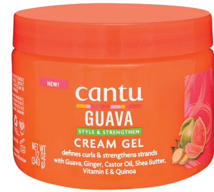
STEP 5 STYLE / DEFINE CREAM GEL 340g 08353-12/3NEUS