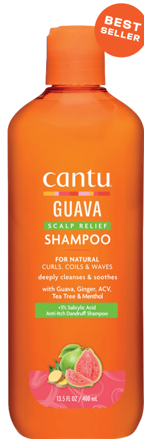
STEP 2 CLEANSE SHAMPOO 400ml 08240-12/3NEUS