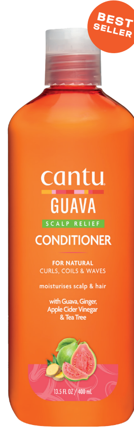
STEP 3 CONDITION CONDITIONER 400ml 08351-12/3NEUS