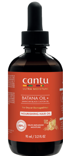
NOURISHING HAIR OIL 95ML 08534-12/3NEU