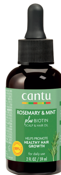
BIOTIN-INFUSED HAIR & SCALP OIL 59ml 08236-12/3NEUSF1