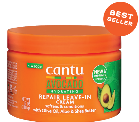
HYDRATING LEAVE-IN REPAIR CREAM 340g 07989-12/3NEUS