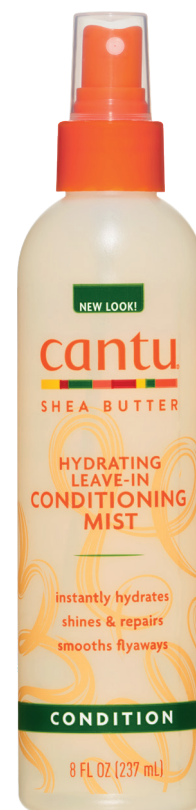
LEAVE-IN CONDITIONING MIST 237ml 07620-12/3NEUS