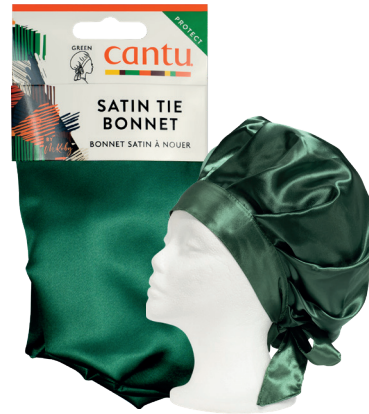
SATIN TIE BONNET 08073-36/3NEU