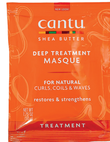
DEEP TREATMENT HAIR MASQUE 55g 07632-24/6NEUS