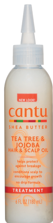
TEA TREE & JOJOBA HAIR & SCALP OIL 180ml 00008-12/3NEUS