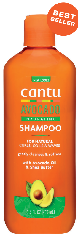
HYDRATING SHAMPOO 400ml 07987-12/3NEUS