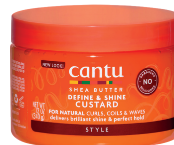
DEFINE & SHINE CUSTARD 340g 07012-12/3NEUS