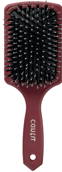
SMOOTH THICK HAIR PADDLE BRUSH 07883-36/3NEU