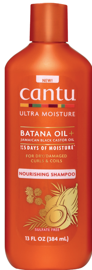
NOURISHING SHAMPOO 355ML 08523-12/3AEUS