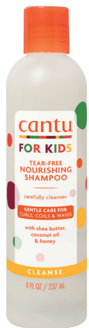
KIDS TEARS-FREE NOURISHING SHAMPOO 237ml 07546-12/3NEUS