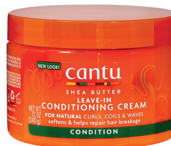
LEAVE-IN CONDITIONING CREAM 340g 07013-12/3NEUS