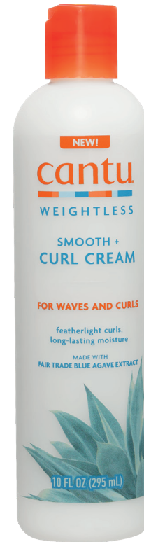
STEP 4 STYLE / DEFINE SMOOTH + CURL CREAM 295ml 08399-L02EUS