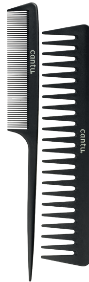
STYLE CARBON FIBRE COMBS 07894-36/3NEU