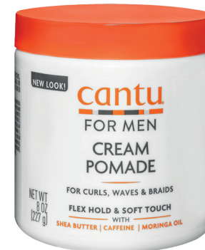
STYLING CREAM POMADE 227G 07678-12/3NEUS