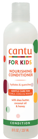
KIDS NOURISHING CONDITIONER 237ml 07547-12/3NEUS