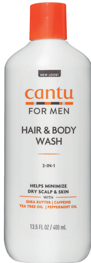
2 IN 1 HAIR & BODY WASH 400ML 07676-12/3NEUS