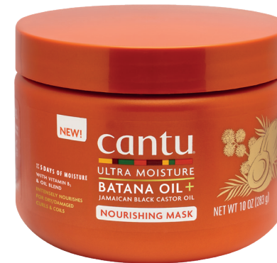
NOURISHING MASK 295G 08524-12/3AEUS