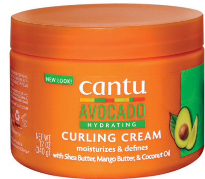
HYDRATING CURLING CREAM 340g 07990-12/3NEUS