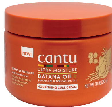
NOURISHING CURL CRM 295G 08526-12/3AEUS